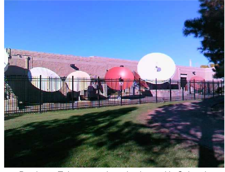
Persistent Telecom earth station located in Colorado

By providing wireless telecommunications services that interoperate over satellite and connect to the Internet and the Public Switched Telephone Network (PSTN), Persistent Telecom has created a sustainable communications solution which functions in the most adverse conditions, when traditional communications networks are not available.